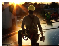
Catching the Sun