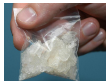
Ebola Meth? Police Joke Nets At Least 1 Drug Arrest