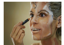
Canadian Artist Transforms Into Comic Characters Online