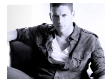
Fat-Shaming Meme Sparks Wentworth Miller to Open Up About Suicide