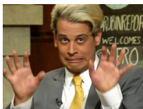
Gay Breitbart Columnist Says LGBT Activism 'Makes Me Want To Go Out And Bash Queers'